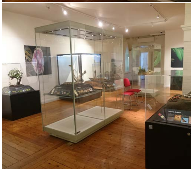
Top: Wiltshire Remembers (Oexmann Gallery) Middle: Snakes (Oexmann Gallery) Bottom: The Black- smith's Craft (Piper Gallery)