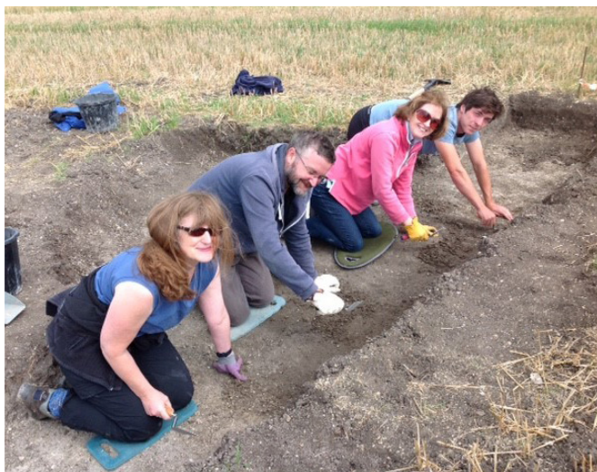
Left: Trainee volunteers; Right: Excavating the hearth of a roundhouse