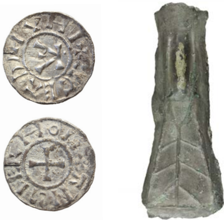
Far left: Early Medieval silver Saint Eadmund memorial penny.