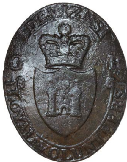
Top Right: Lacock Cup (2019.5) © British Museum Bottom Right: Regimental badge 2018.13 © PAS

The DLV badge was donated to the Museum by Mark Flitton, Rodbourne, Swindon, and is on display in the Story of Devizes Gallery (2018.13)