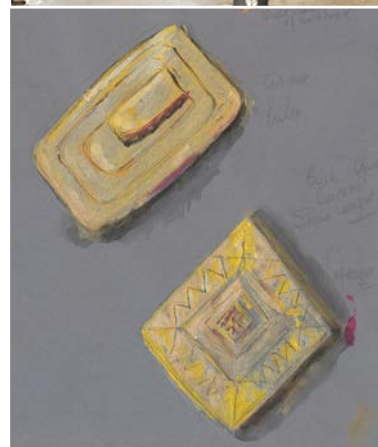
From the top: Vote 100 at the Devizes Carnival; the Empire Soldiers workshop; artwork created Drawing on the Ancient Past