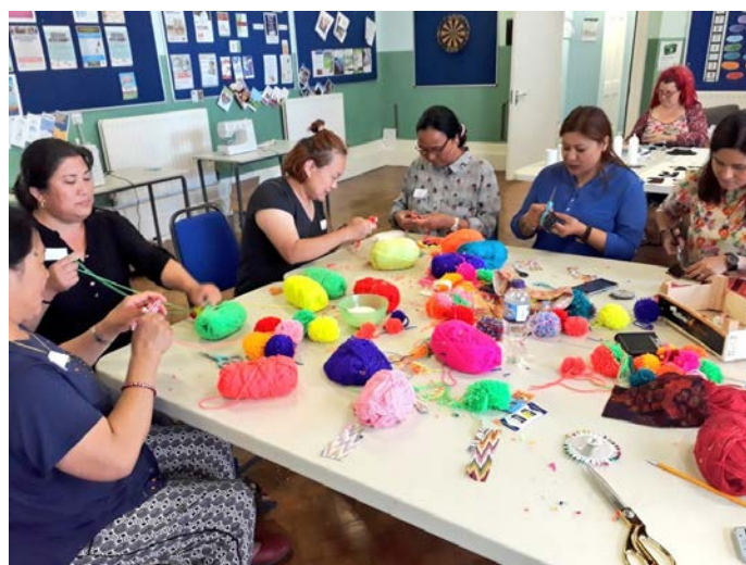
Wives of Gurkha Soldiers making pom-poms for banners