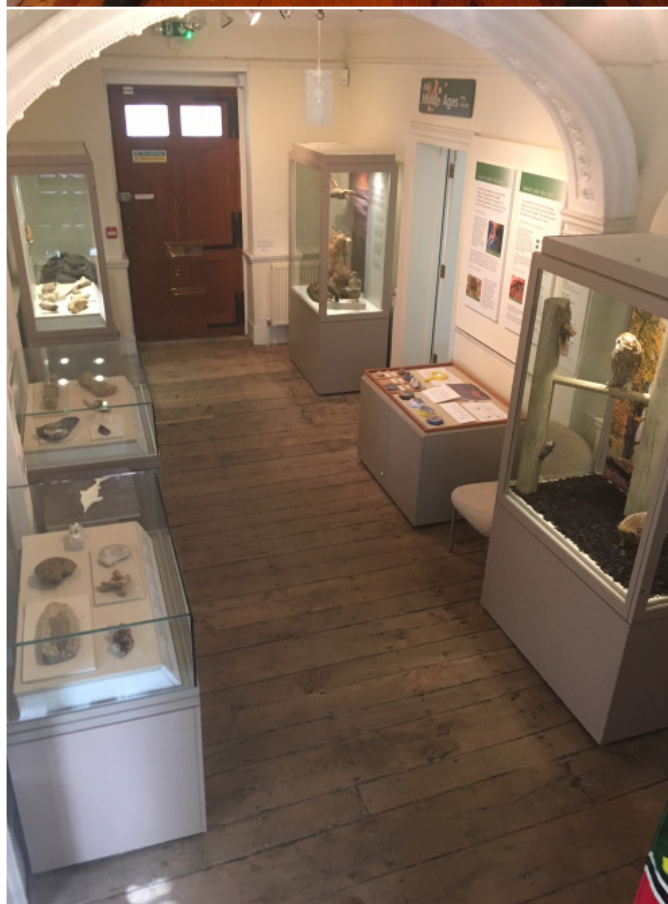
Top: our handling collection, available to visitors during school holidays. Middle: Soldiers from Larkhill read names of the Wiltshire fallen from World War 1 in our 'Wiltshire Remembers' exhibition on 7 November 2018, as part of a county-wide commemorative programme. Bottom: New Environment Gallery in the 'Old Entrance Hall'.