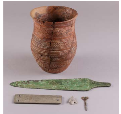
Right: Roundway G8 group, loaned to MuseumPartners.