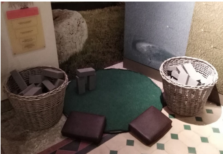
Iron Age Gallery

I can build my own mini-Stonehenge with these foam blocks