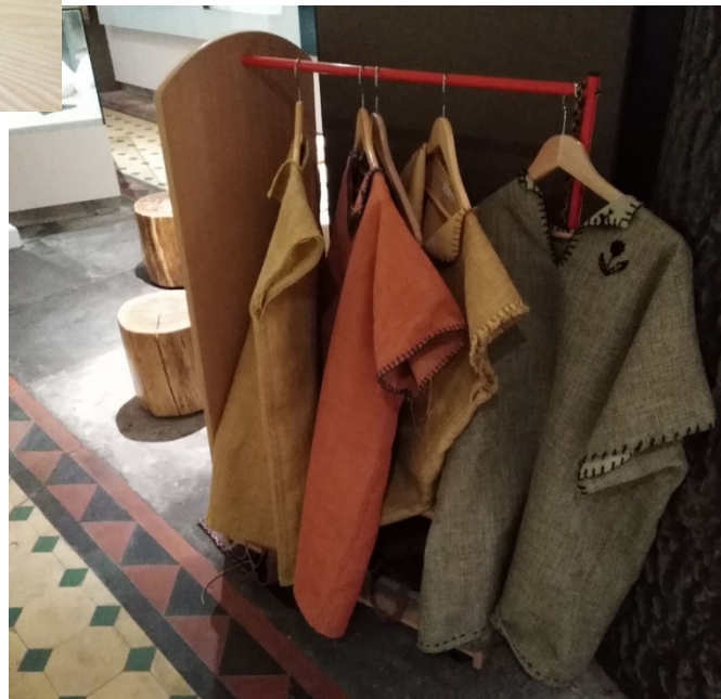
Prehistoric Wiltshire Room 3