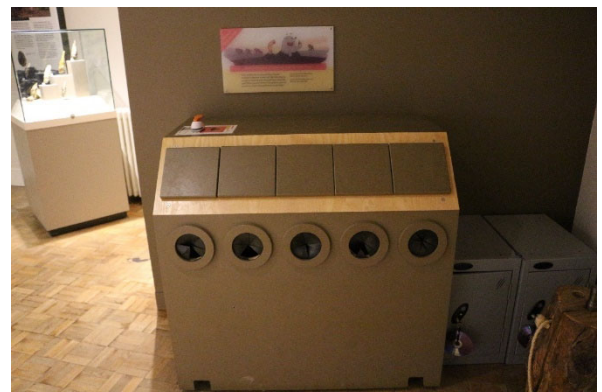
Prehistoric Wiltshire Gallery – Room 2

I can put my hands inside the round holes to feel the objects inside.